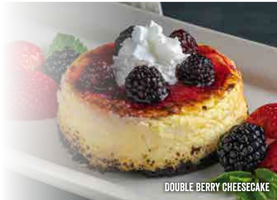
DOUBLE BERRY CHEESECAKE

One scoop topped with whipped cream, chocolate sauce and a cherry! 3.49