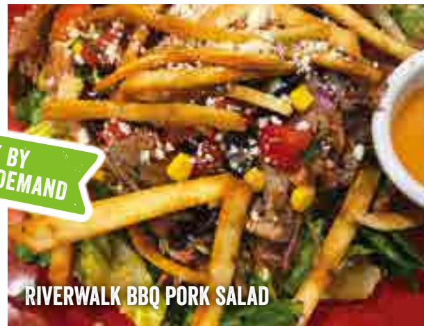
RIVERWALK BBQ PORK SALAD