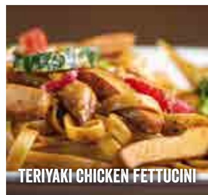
TERIYAKI CHICKEN FETTUCCINI