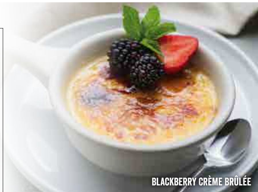
BLACKBERRY CRÈME BRÛLÉE

Catering is available for all of your important events or special occasions. • Please ask for one of our catering menus for further details. • There is a $1.00 charge for all split orders. • Gift Cards available in any amount. • Prices and ingredients subject to change. • We accept Visa, Mastercard, Discover, American Express and cash. • Parties of eight or more are subject to an 18% gratuity; we ask the same of parties wishing separate checks. • If you have not been provided with a Customer Comment Card, please ask for one. • Consuming raw or undercooked meat, seafood or egg products can increase your risk of food-borne illness. • Thank You!