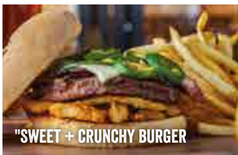
"SWEET + CRUNCHY BURGER"