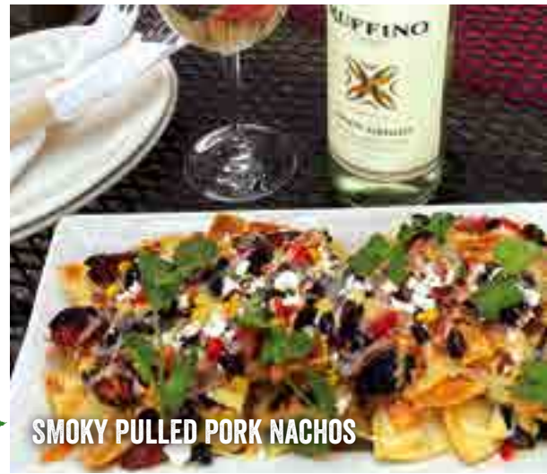
SMOKY PULLED PORK NACHOS