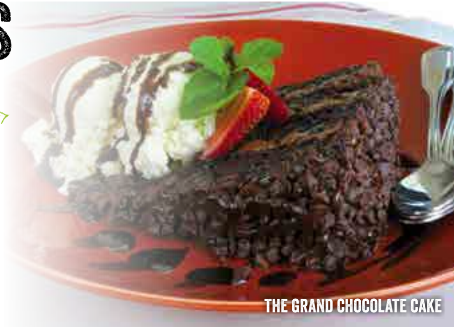
THE GRAND CHOCOLATE CAKE

Dark Chocolate cake layered with Milk Chocolate Mousse and topped with chocolate ganache. Served with vanilla bean ice cream, whipped cream, and a drizzle of chocolate sauce. The perfectly sharable dessert! 11.99