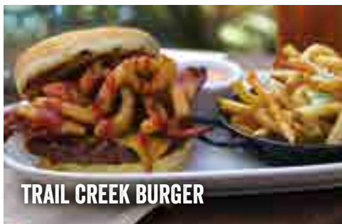
TRAIL CREEK BURGER

Roasted turkey with grilled apple, raspberry-red onion jam, mayo and creamy brie cheese on toasted ciabatta . 15.99