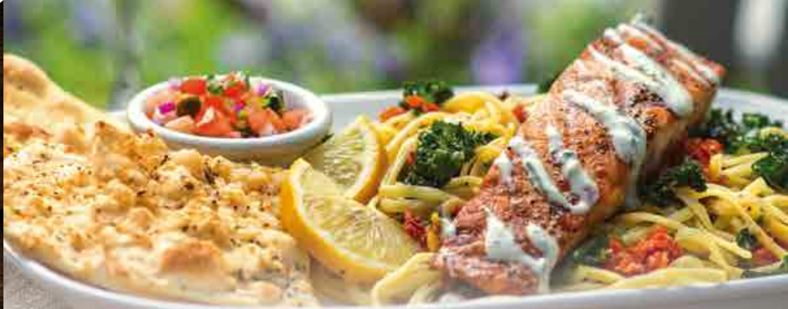
GRILLED SALMON PASTA