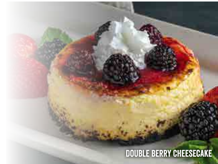
DOUBLE BERRY CHEESECAKE