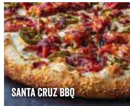
SANTA CRUZ BBQ

Mushrooms, onions, bell peppers, olives and tomatoes.