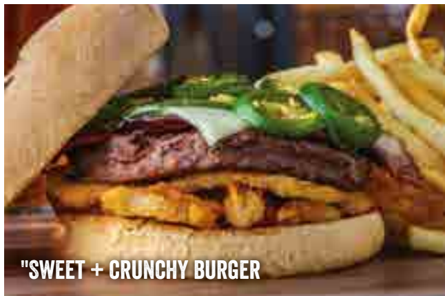
"SWEET + CRUNCHY BURGER