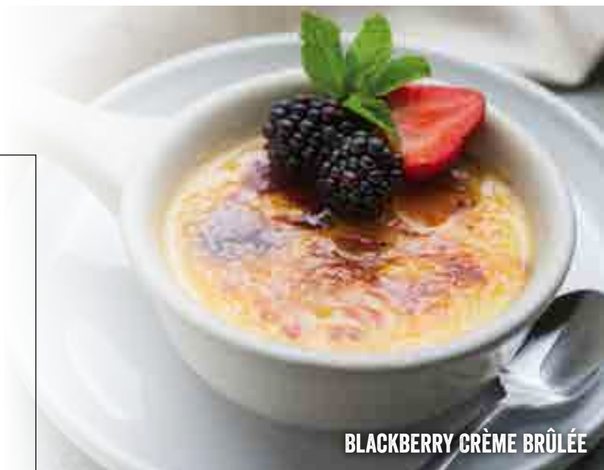
BLACKBERRY CRÈME BRÛLÉE