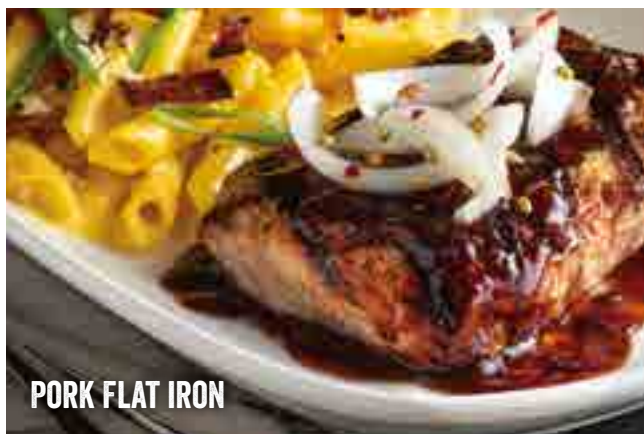
PORK FLAT IRON