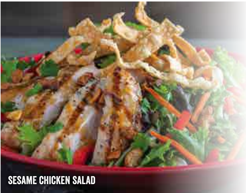
SESAME CHICKEN SALAD

Classic Caesar salad served with seasoned grilled chicken breast and herbed flatbread. 14.99