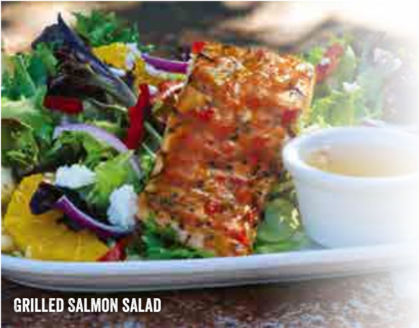
GRILLED SALMON SALAD