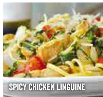
SPICY CHICKEN LINGUINE