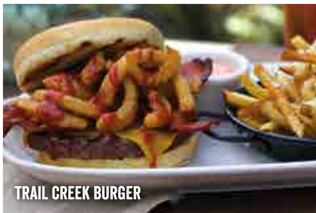
TRAIL CREEK BURGER

ALL SANDWICHES are served with SHOESTRING FRIES . Upgrade to GARLIC PARMESAN FRIES or SIDE SALAD for 1.99