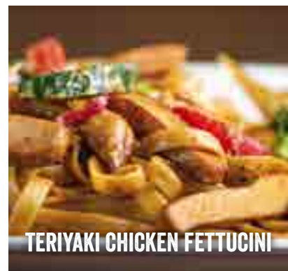
TERIYAKI CHICKEN FETTUCCINI