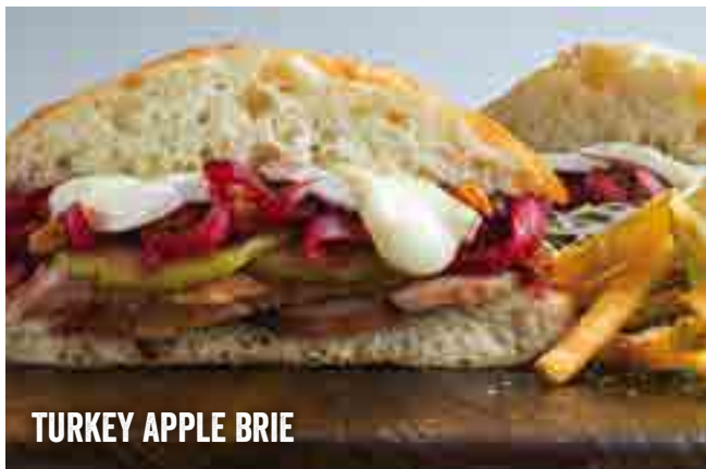
TURKEY APPLE BRIE