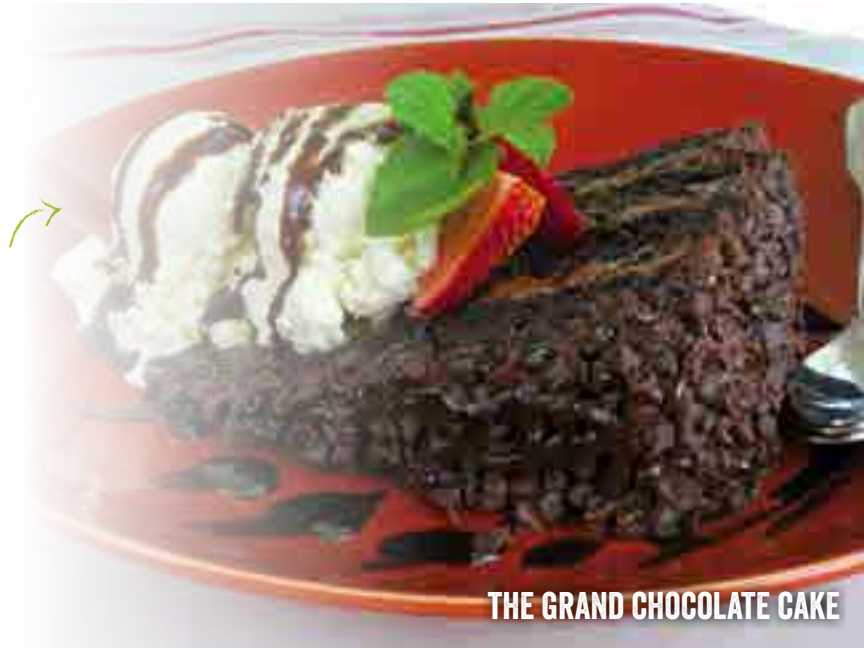
THE GRAND CHOCOLATE CAKE

Catering is available for all of your important events or special occasions. • Please ask for one of our catering menus for further details. • There is a $1.00 charge for all split orders. • Gift Cards available in any amount. • Prices and ingredients subject to change. • We accept Visa, Mastercard, Discover, American Express and cash. • Parties of eight or more are subject to an 18% gratuity; we ask the same of parties wishing separate checks. • If you have not been provided with a Customer Comment Card, please ask for one. • Consuming raw or undercooked meat, seafood or egg products can increase your risk of food-borne illness. • Thank You!