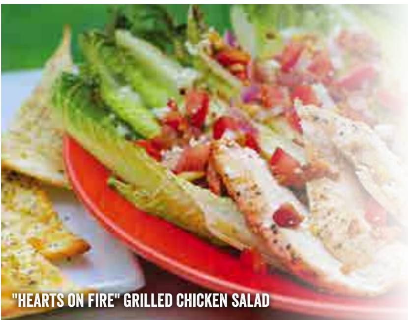
"HEARTS ON FIRE" GRILLED CHICKEN SALAD

Grilled hearts of romaine topped with a marinated chicken breast, balsamic drizzle, bleu cheese crumbles, toasted pine nuts, red onions, tomatoes, and crispy applewood smoked bacon. Comes with a housemade herbed flatbread. 17.99