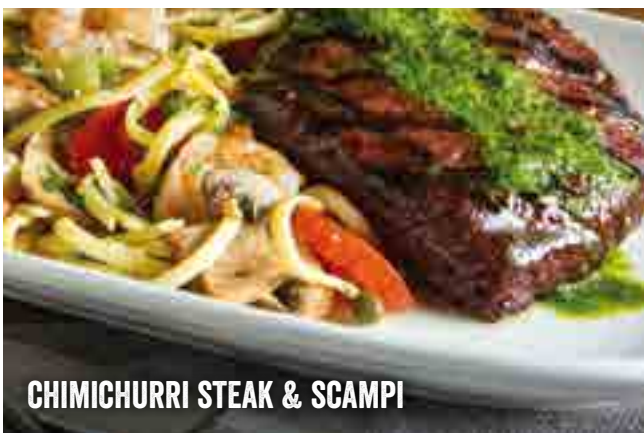
CHIMICHURRI STEAK & SCAMPI