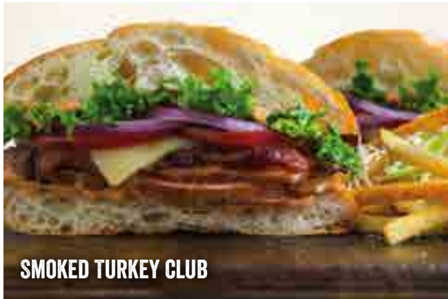
SMOKED TURKEY CLUB

Crispy Chicken Sandwiches feature TENDER CHICKEN BREAST fried to golden brown served with mayo on our TAVERN BUN . 13.99