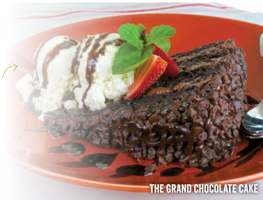
THE GRAND CHOCOLATE CAKE

Catering is available for all of your important events or special occasions. • Please ask for one of our catering menus for further details. • There is a $1.00 charge for all split orders. • Gift Cards available in any amount. • Prices and ingredients subject to change. • We accept Visa, Mastercard, Discover, American Express and cash. • Parties of eight or more are subject to an 18% gratuity; we ask the same of parties wishing separate checks. • If you have not been provided with a Customer Comment Card, please ask for one. • Consuming raw or undercooked meat, seafood or egg products can increase your risk of food-borne illness. • Thank You!