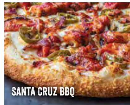
SANTA CRUZ BBQ

Mushrooms, onions, bell peppers, olives and tomatoes.